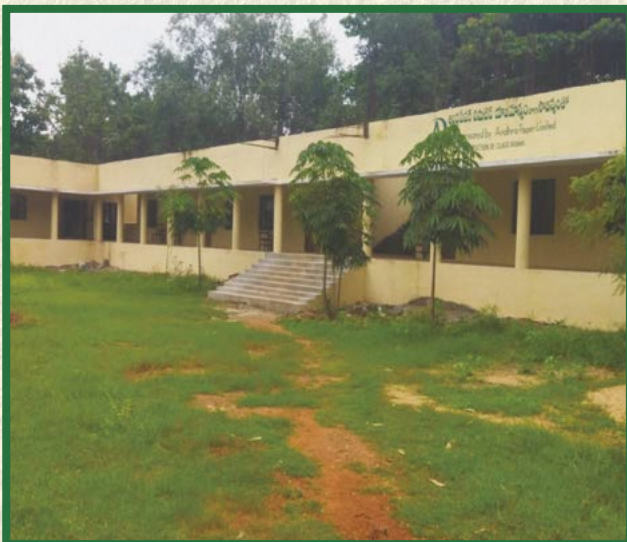
Construction of Class rooms to DIET Government College, Bommuru, Rajahmundry