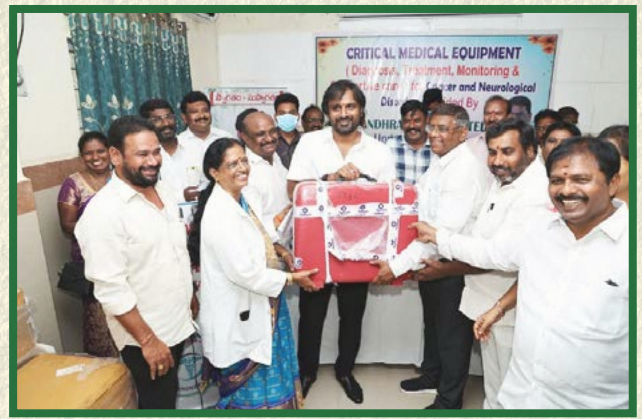
Supply of Critical Medical Equipment to Government Hospital, Rajahmundry