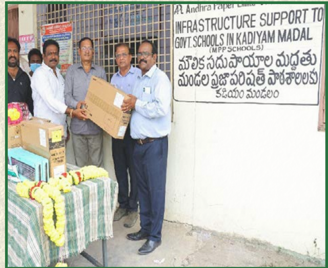
Infra support to Government Schools in Kadiyam Mandalam