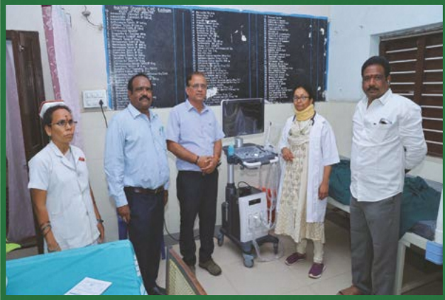
Supply of Medical Equipment to Government Hospital, Kadiyam