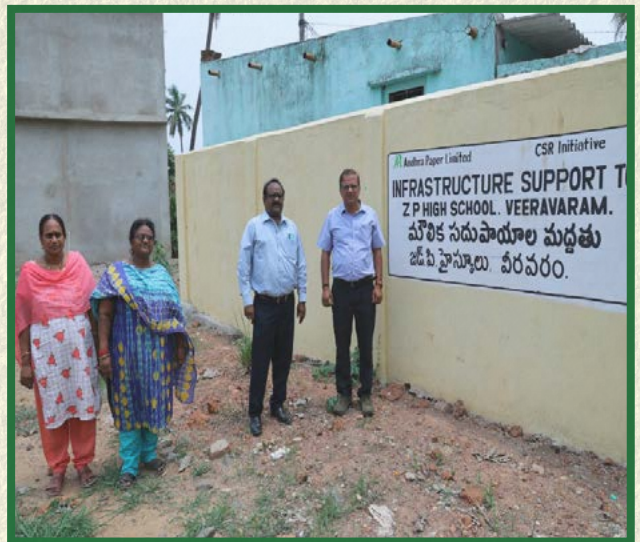
Infra support (Compound Wall) to MPP School, Kesevaram, East Godavari District