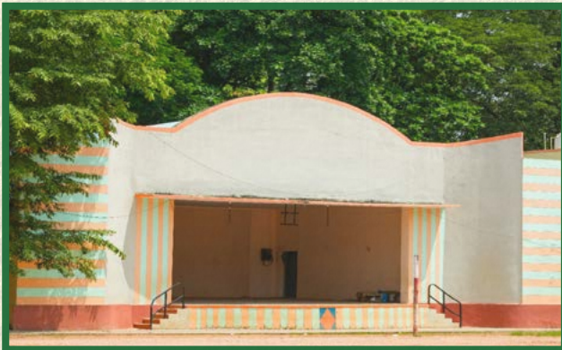
Renovation of Auditorium at APPM High School, Rajahmundry

To take proactive steps and embrace opportunities to make positive, long term and meaningful contributions to the communities that are located around the company's manufacturing facilities and farm forestry areas.