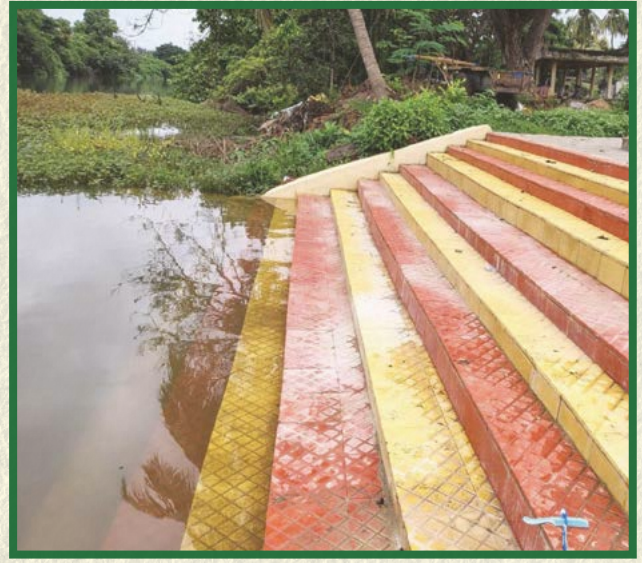
Constructed Bathing Ghat at Kadiyam Mandalam