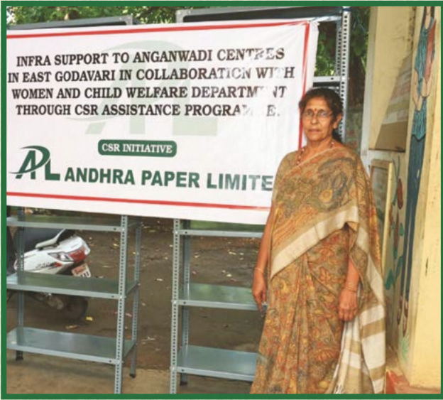
Infra support for 1100 Anganwadi Centres in East Godavari in collaboration with Women and Child Welfare Department