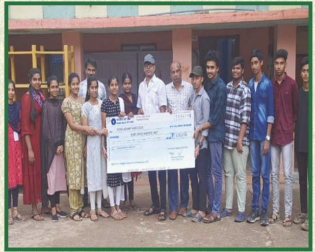
Merit Scholarship presentation to 10th Class students in East Godavari Division