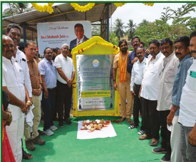
Laid Foundation stone for construction of sump cum pump house at Kotilingalapeta, Rajahmundry