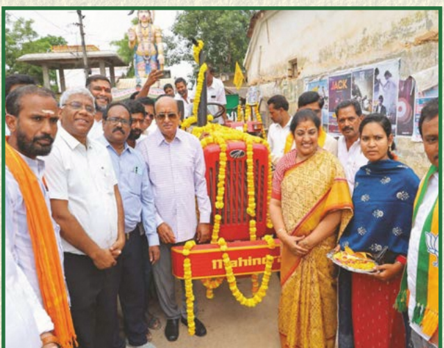
Supply of Vehicles to Kadiyam Panchayat for Waste Management