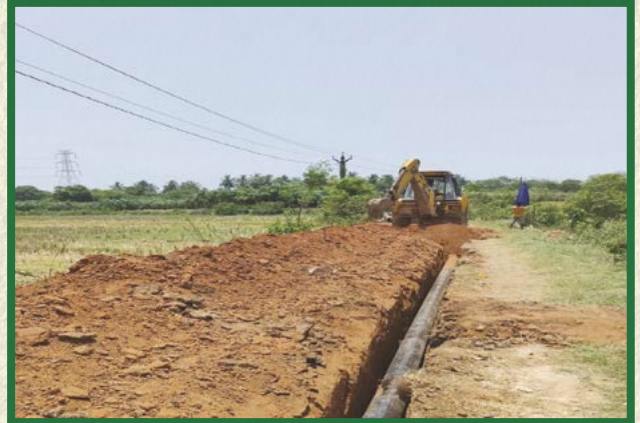
Supply of treated water for agriculture lands at Kondagunturu, East Godavari District