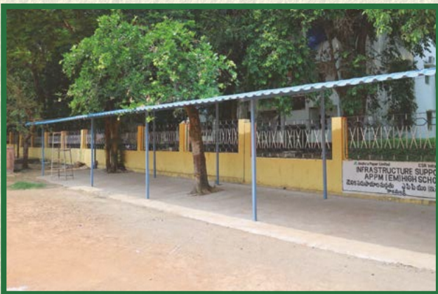
Constructed cycle shed at APPM High School, Rajahmundry