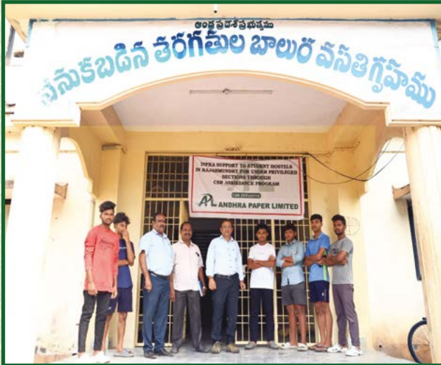
Infra support to Student Hostels in Rajahmundry for under privileged sections