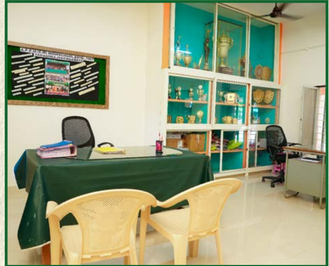
Infra Support to APPM High School, Rajahmundry