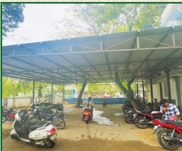
Parking Shed, Visitors Rooms for General Public at Sub-Collector Office, Rajahmundry