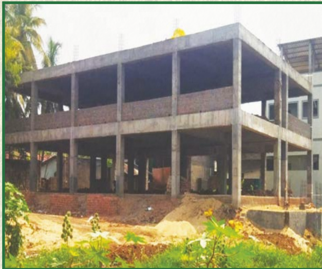
Construction of Old age home and community centre at Kadiyam, East Godavari District