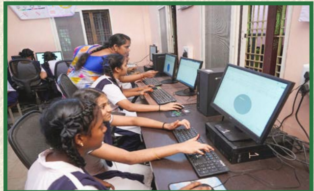
Provided computer lab facilities to APPM High School, Rajahmundry