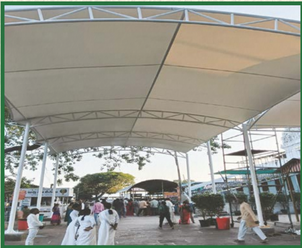
Constructed Tensile Shed for Devotees at Annavaram Temple