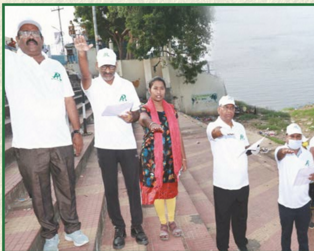
Swachhata Hi Sewa at Godavari Area, Rajahmundry