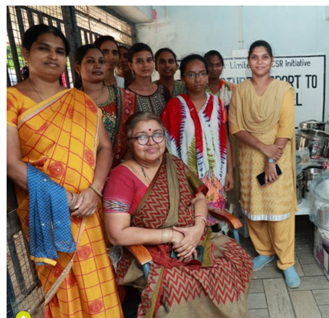
Infrastructure support to working womens Hostel, Rajahmundry