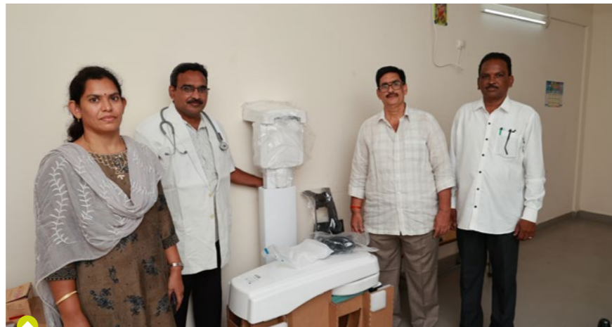
Equipment Support to ESI Hospital, Rajahmundry

To take proactive steps and embrace opportunities to make positive, long-term, and meaningful contributions to the communities that are located around the Company's manufacturing facilities and farm forestry areas