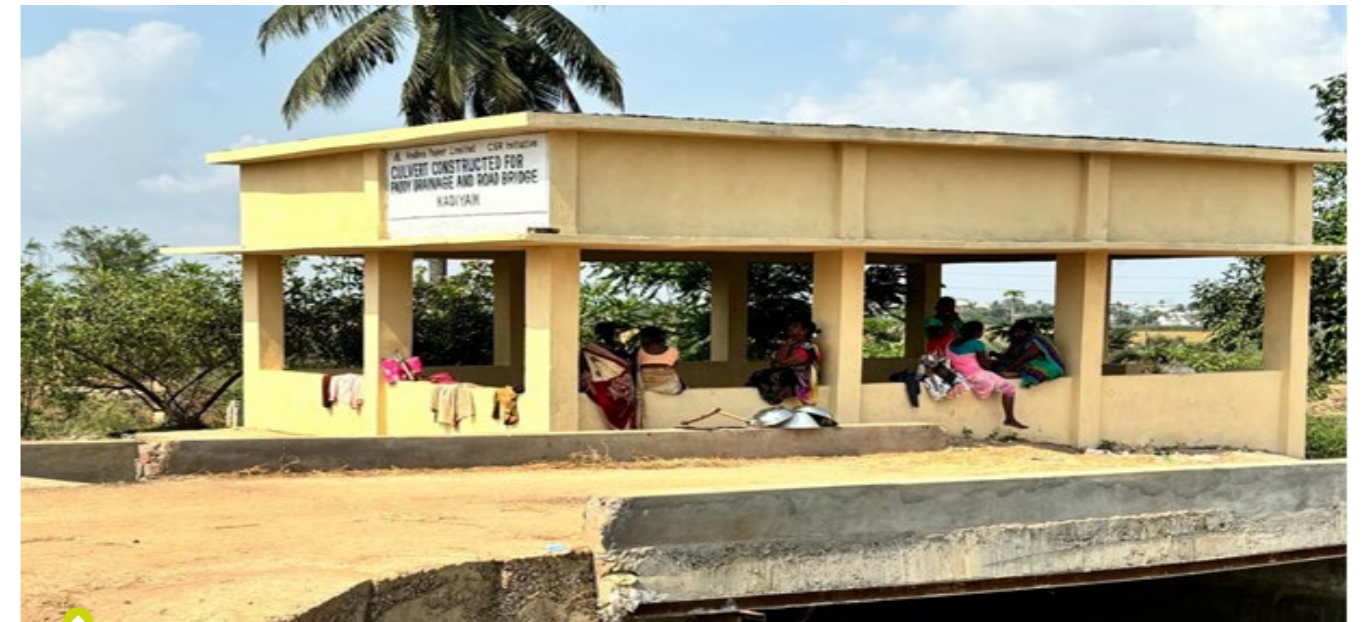
Culvert construction for paddy drainage and road bridge, Kadiyam Mandal, East Godavari