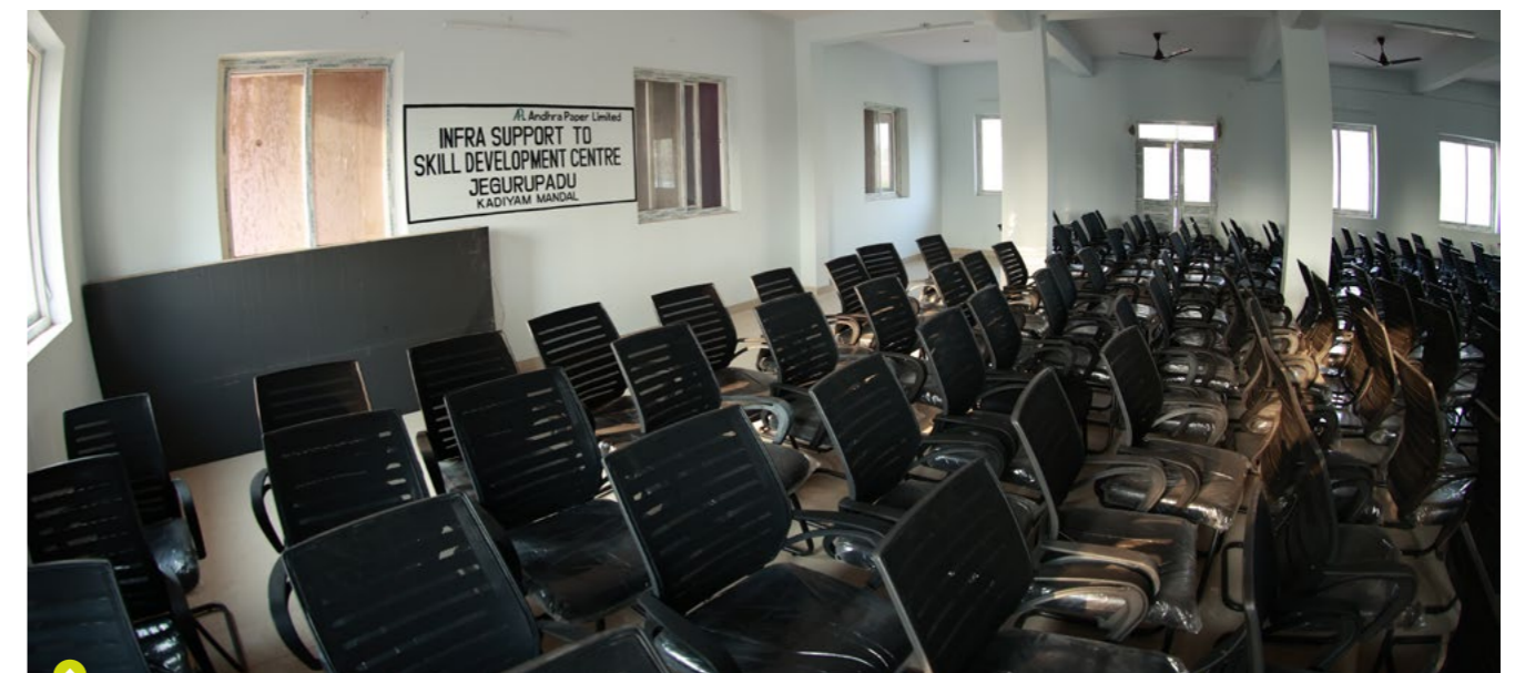
Infra Support to Skill Development Centre, Jegurupadu, Kadiyam Mandal, East Godavari