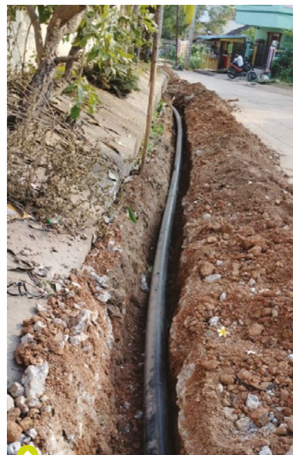
Laid pipelines in Kadiyam Village