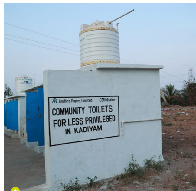
Constructed community toilets for under privileged in Kadiyam