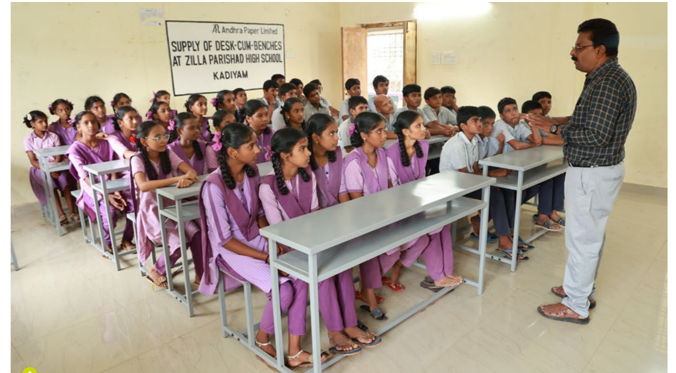
Infrastructure support to Zilla Parishad High School, Kadiyam