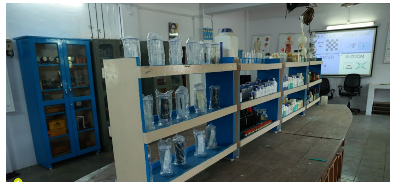
Infrastructure support to Science Lab to APPM Model School, Sriram Nagar, Rajahmundry