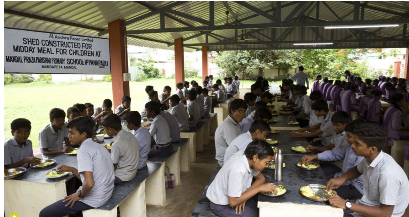
Constructed shed for Mid-day Meal for school children in Kadiyam Mandal Parishad primary school at Ippanpadu