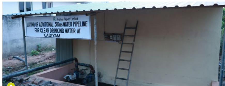
Laid 3 Kms. pipeline providing drinking water facility to the villagers of Kadiyam, East Godavari District