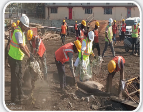
C E I G (Chief Electrical Inspector of Government) Inspection by APTRANSCO officials.