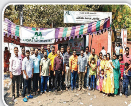
Maha Sivaratri Prasada Vitharana