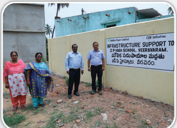
Constructed Compound wall at ZP High School, Veeravaram.