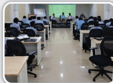
Technical Training to Field staff – Farm Forestry team by IFGTB Senior Scientists on sustainable Plantation practices.