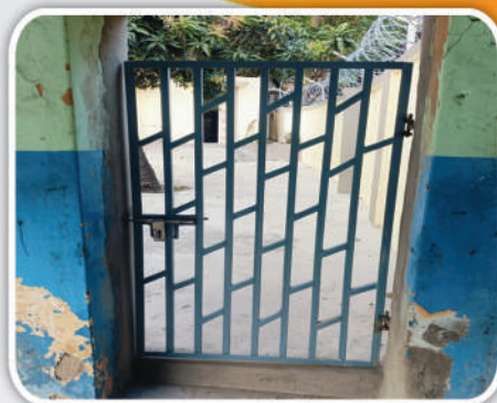
Constructed Fencing, Flooring, Washrooms and Gate for Hostel students from less privileged sections in Rajahmundry.