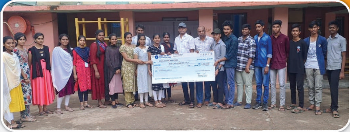
Merit Scholarships were awarded to 10th class students in the East Godavari Division.