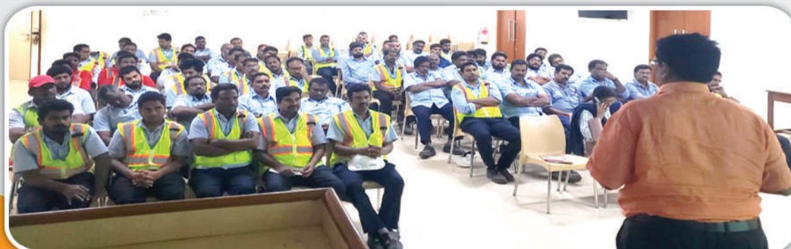
Confined space training session by Deputy Chief Inspector of Factories.