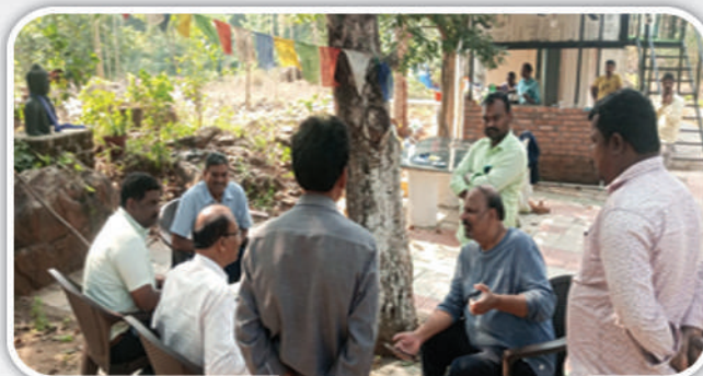
Farmers Meeting with Addateegala Tahasildar.

Andhra Paper Ltd. focuses on farmer welfare within 150 km, raising awareness through meetings and materials, leading to increased pulpwood planting (Casuarina, Subabul and Eucalyptus).