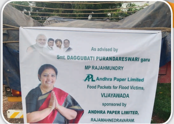
Supplied Food Packets for flood effected people at Vijayawada, Andhra Pradesh.