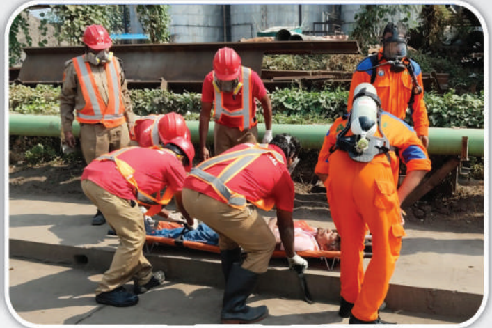
Andhra Pradesh Fire Disaster Team conducted mock drill along with APL team