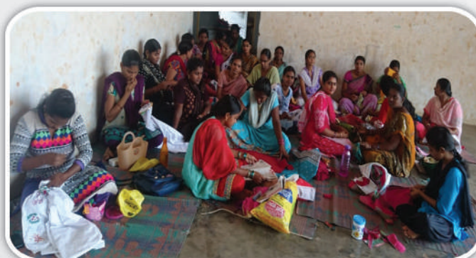
Women empowerment through Skill development at Rajahmundry & Kadiyam.