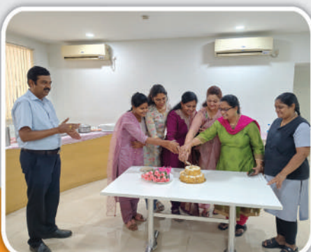
Women's Day Celebrations