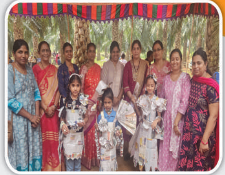
Garden Party Celebrations