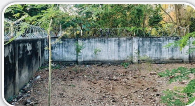
Constructed Fencing and Bore well pump for drinking water for Hostel students from less privileged sections in Rajahmundry.