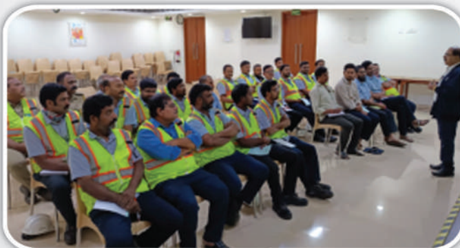
Safe work Observation & Accident Causation theory training session by External trainer.