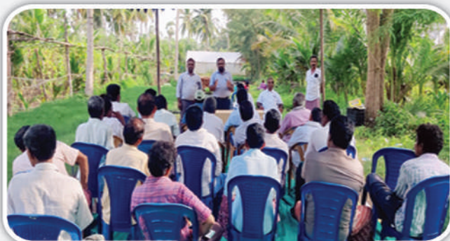
Farmers Meeting at Perupalem, Narasapuram.