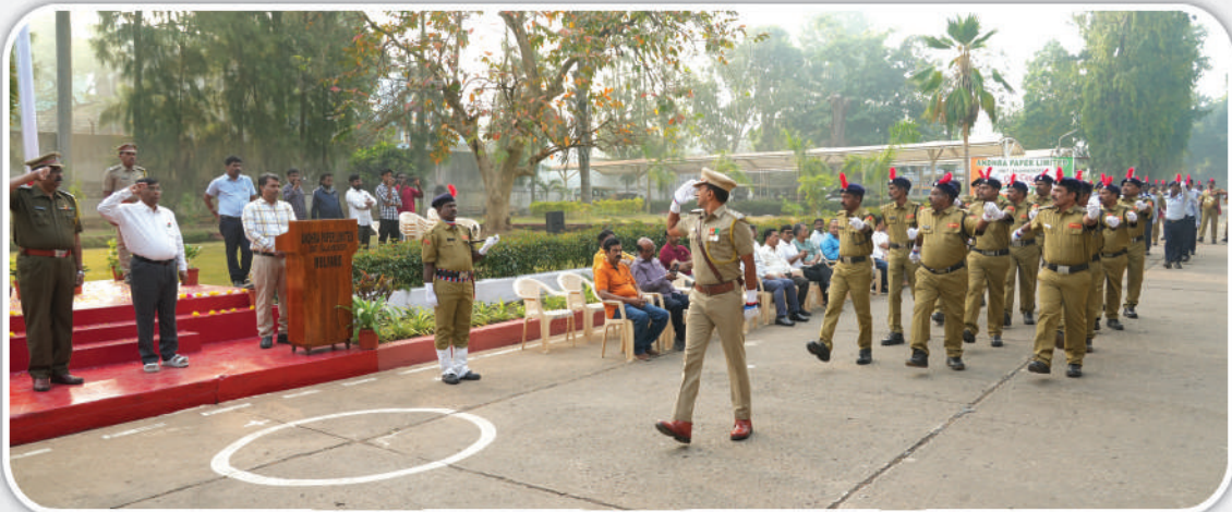
Republic Day celebrations on 26th January 2025 at Rajahmundry & Kadiyam Units.