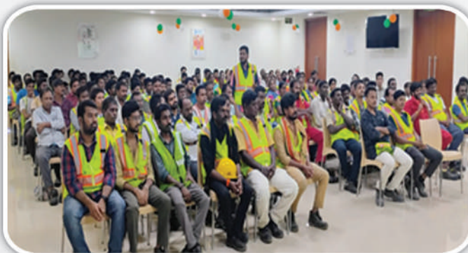
Refresher & Basic Hazard Recognition training conducted for contract workmen.