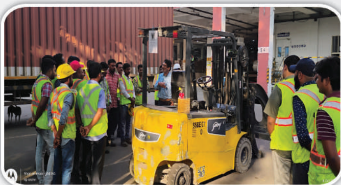
Forklift Operators Training conducted to mill wide forklift operators for both units Rajahmundry & Kadiyam by External Trainer & Certificates issued.