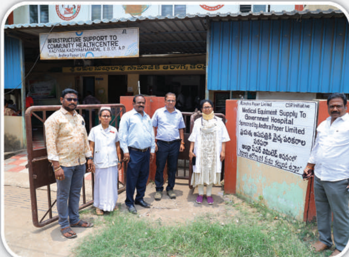
Medical equipment support to Community Health Center, Kadiyam.