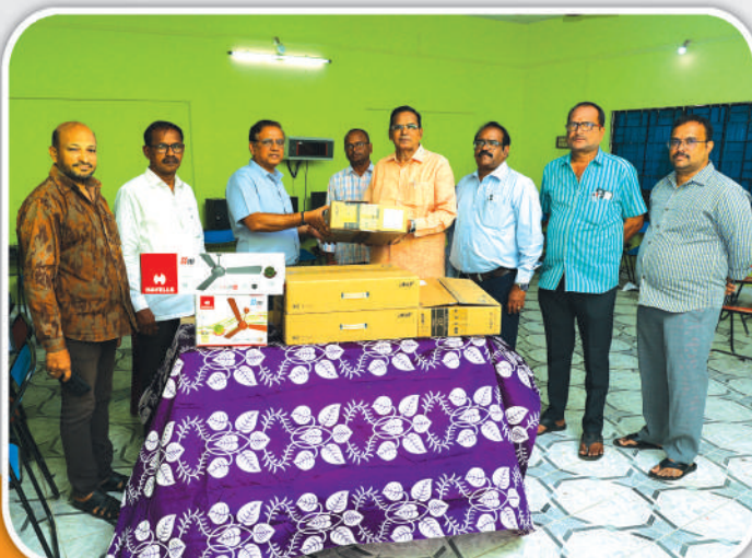
Infrastructure support to Andhra Kesari Degree College, Rajahmundry.