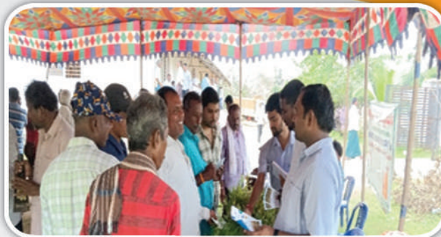
Meeting with Farmers at West Godavari District.