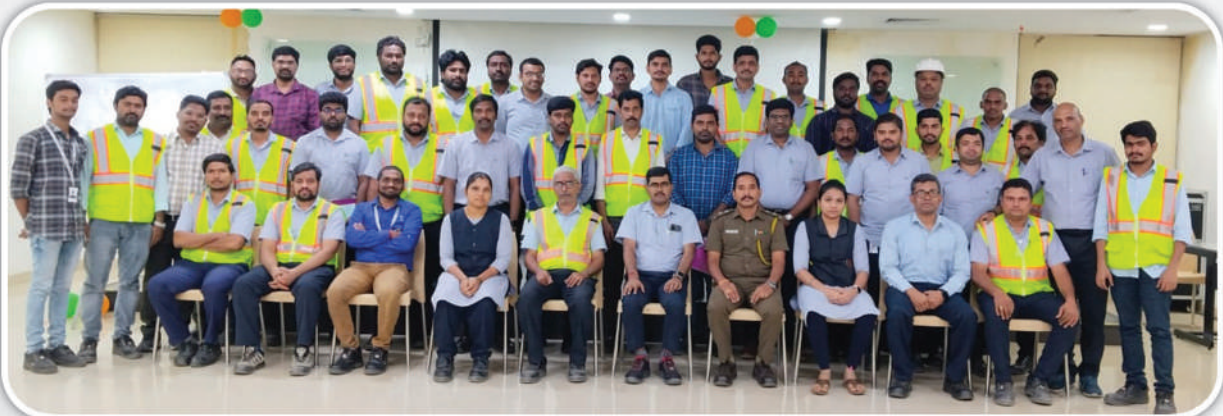
ME- White Belt Training program for Newly Joined Employees by Internal Manufacturing Excellence Team.