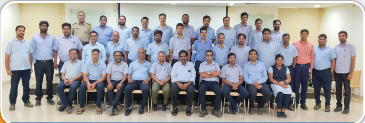
Energy Management System Training Program to our Internal Auditors by M/s. ECSOL team.