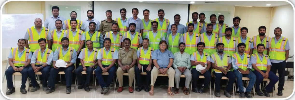
First Aid and Power Medicine Training program to First Aid Trainers by St John Ambulance Association - Kakinada.