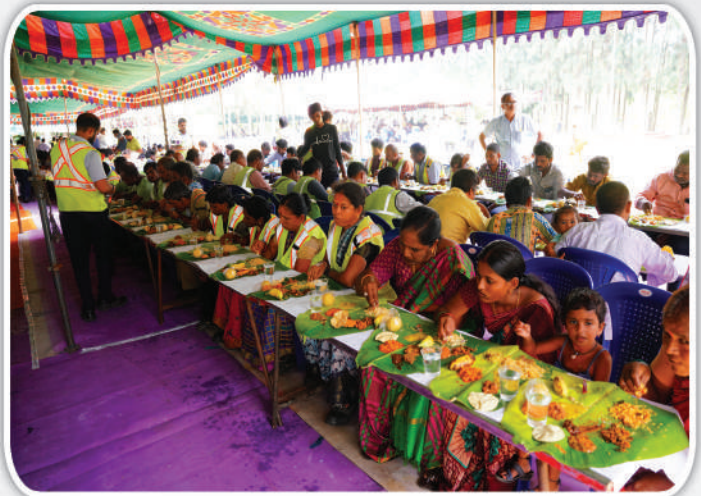
Annual Feast at Kadiyam Unit