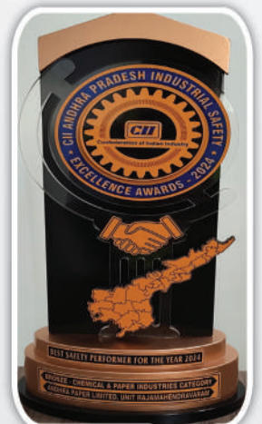
Secured BRONZE in the Chemical & Paper Industries category, "BEST SAFETY PERFORMER" for the year 2024 at CII (Confederation of Indian Industry) Andhra Pradesh Industrial Safety Excellence Awards 2024