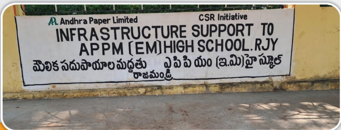
Renovation of Administrative Office, Windows, Play School, Auditorium and constructed a Cycle Shed at APPM Model (E.M.) High School, Rajahmundry.