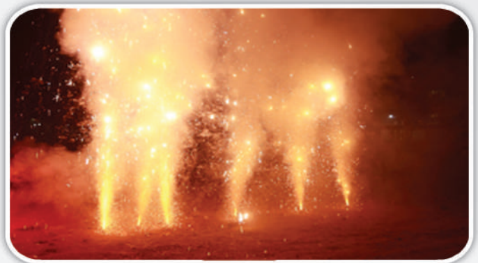
Fire Crackers show