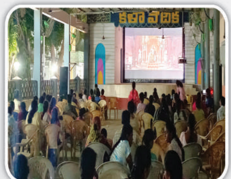
Monthly Movie at Staff Club