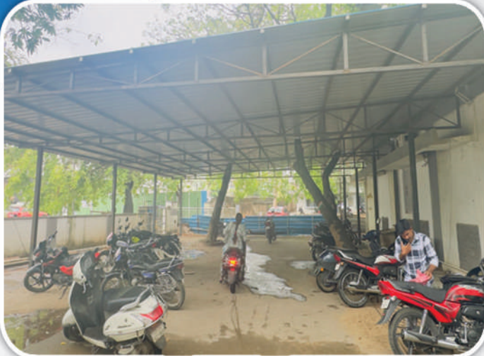
Vehicle parking shed for visiting public at Sub Collector's Office, Rajahmundry.