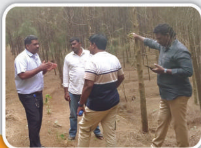
Visit to Plantations & CPC – Interested Farmers are taken to Progressive Farmers Plantation to encourage Farmers to Plant Pulpwood Plantations.