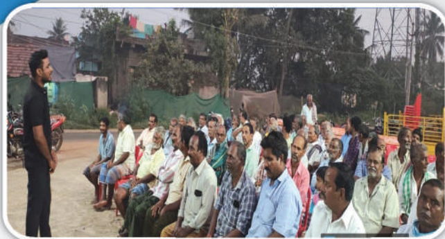
Meeting with Farmers at Rayavaram.