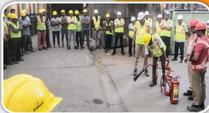
Fire Fighting Training Programs to APL Employees.