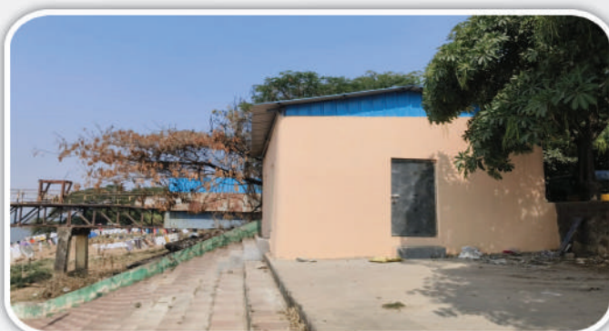
Constructed Roof shed for Washermen in Kotilingala Ghat, Rajahmundry.