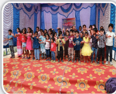
Garden Party Celebrations